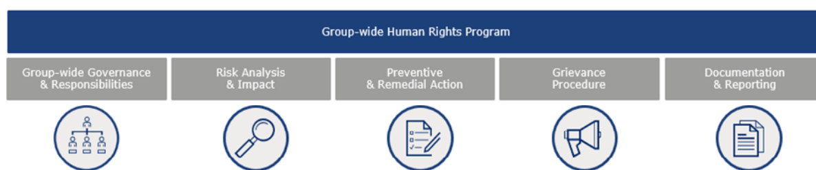
Graphic 1: The five building blocks of our Human Rights Program

Our human rights due diligence – for our own operations and supply chains – is based on five building blocks: